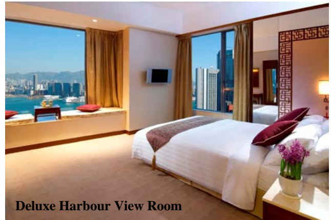
Deluxe Harbour View Room