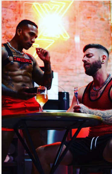
BOXER CAFE BAR