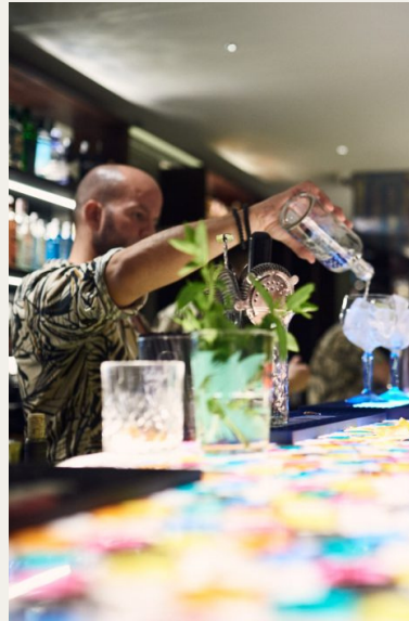
SKY BAR @ AXEL HOTEL

Barcelona's gay scene boasts incredible options to kickstart your night. Believe dazzles with its super drag shows, Boxer offers an edgy underground vibe, and Candy Darling is the epitome of unapologetic queerness. Each venue promises a unique and vibrant start to an unforgettable evening in the heart of Barcelona's LGBTQ+ community.