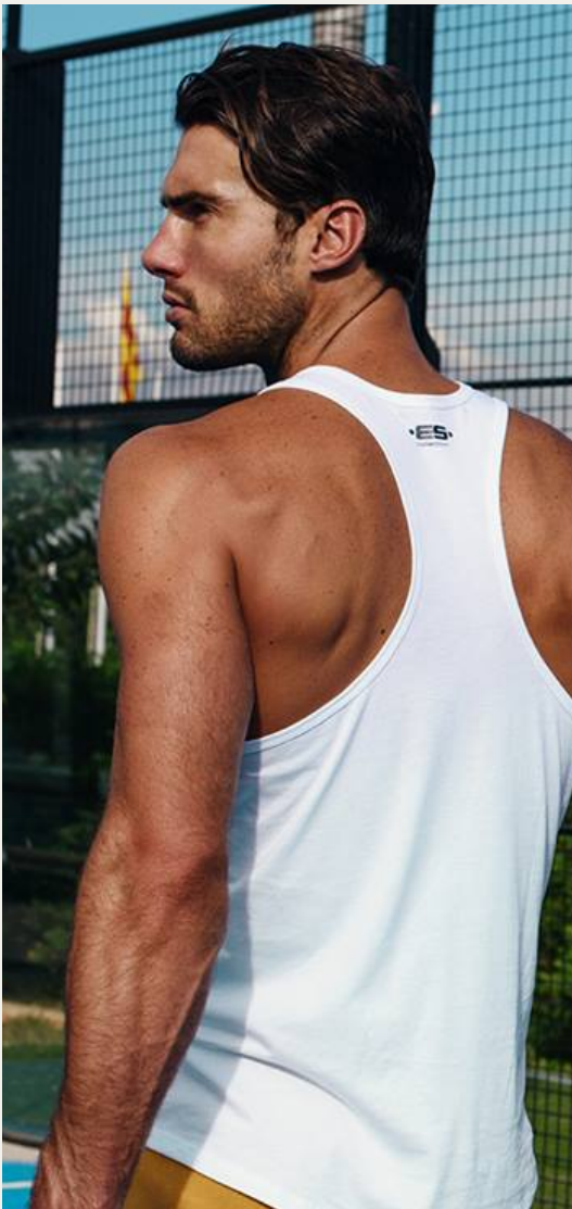
ES COLLECTION / ADDICTED