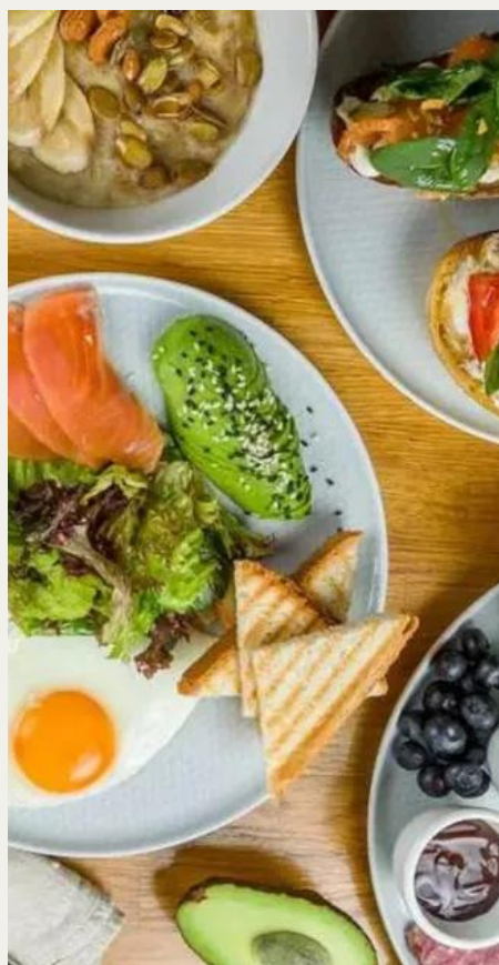
LA ROEL BRUNCH & CLUB